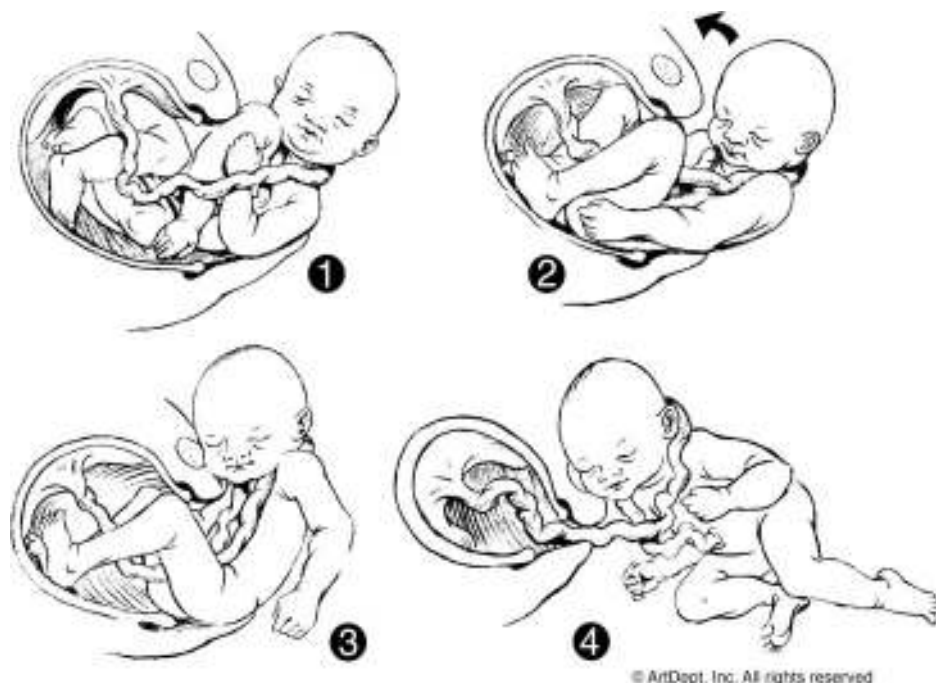
Figure 6.1 Somersault manoeuvre.

Schorn and Blanco (1991) first introduced a technique known as the somersault manoeuvre as an alternative to the usual practice of ICC of the cord when a tight nuchal cord is encountered at birth (see Figure 6.1). Mercer et al. (2005) recommends using the somersault manoeuvre followed by DCC when a tight nuchal cord is present. The somersault manoeuvre not only preserves the integrity of the cord but facilitates the practice of DCC which is particularly important as many infants with a tight nuchal cord experience some degree of hypovolaemia (Cashore & Usher 1973; Vanhaesebrouck et al. 1987; Iffy et al. 2001; Mercer et al. 2005).